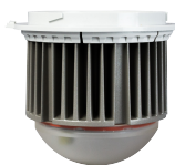
Q-Lux #QX1205C #QX1202C