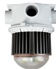
Q-Lux Fixture #QXH120xC