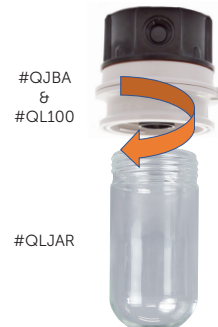
Twist lock Q-Lume base & jar with any LED or CFL