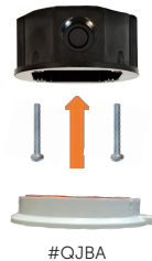
Install junction box adapter