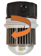
Install adapter and Q-Lux fixture

Material ..... Non-metallic, high performance polycarbonate, and high temp rated gasket