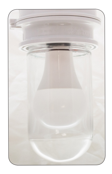
Q-Lume Fixture, Glass Jar Part # QL300J*

products@energyficient.com | energyficient.com | 800-713-3732